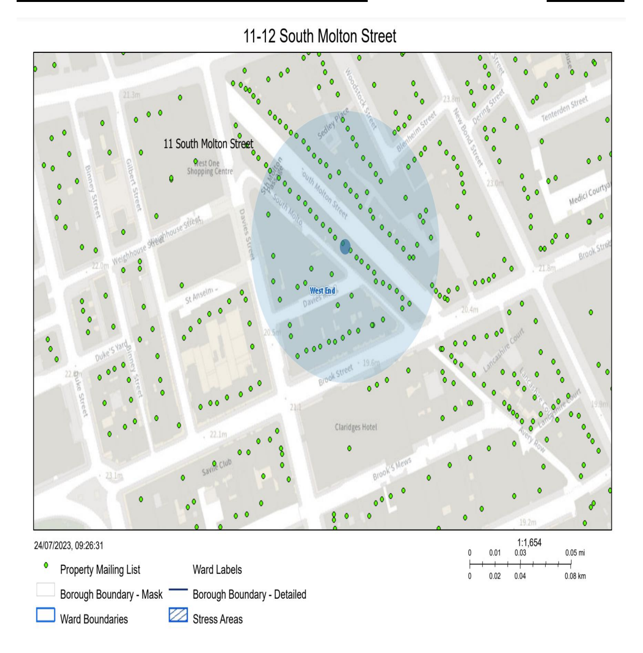
Resident count: 21